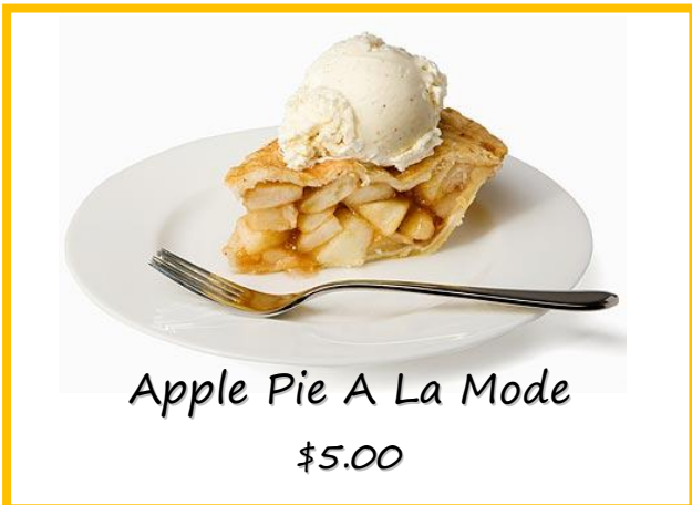
Apple Pie A La Mode $5.00

Irish Cream & Coffee $7.00 topped with whipped cream